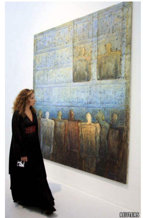
So much to take in